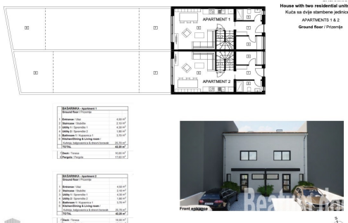
House with two residential units Kuća sa dvije stambene jedinice APARTMENT 1 & 2 Ground floor / Prizemlje

Dual House, under construction, surroundings of Poreč On the ground floor: one bathroom, kitchen, dining room, living room, terrace First floor: two rooms, one bathroom At the attic: one room, one bathroom Parking Opportunity, a house at this stage of construction for sale with discount